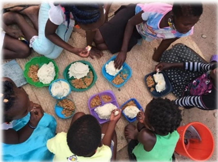
Children at Beach Art Gallery School enjoying a meal from the support from the Amplify Action, BAGS partnership.