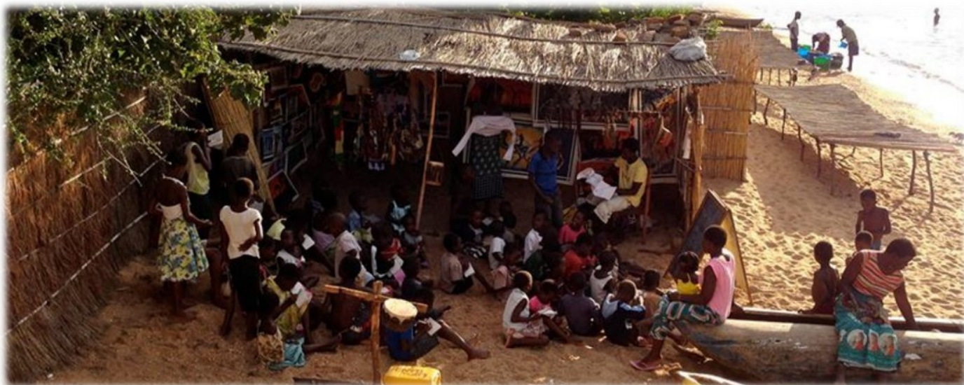
180 children at Beach Art Gallery School in Malawi are now guaranteed a regular nutritious meal three times a week