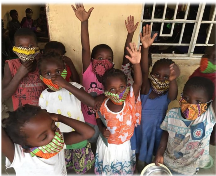
Children wearing facemasks crafted and provided by Beach Art Gallery School in 2020.

We are excited to be developing a programme in partnership with them that will embed sustainable systems of agricultural and income generating activities for the school, during 2022.